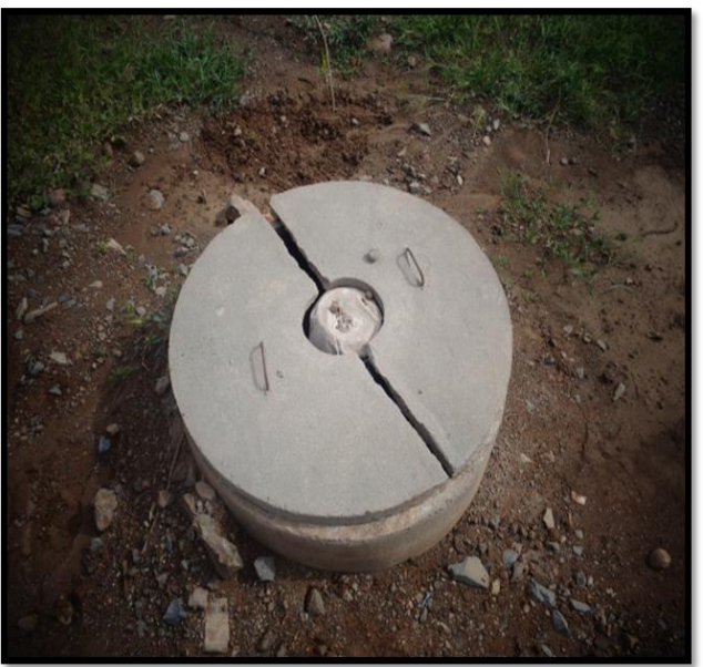
Rain Water Harvesting Structure