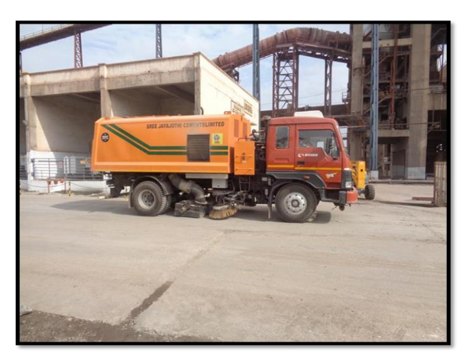
Road Sweeping Machine