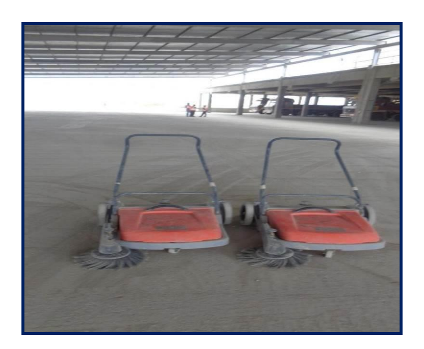
Floor Sweeping Machi